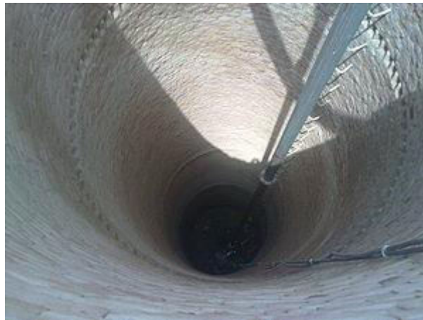
Sampling from tube well

4. Chloride: Chloride contents in fresh water is largely influenced by evaporation and precipitation. Chloride is the most troublesome anion in the irrigation water. They are generally more toxic than sulphate to most of the plants and are the best indicator of pollution. Chloride contents varied from 175 to 325 mg/L in all the samples, which is all within the limit. [6]