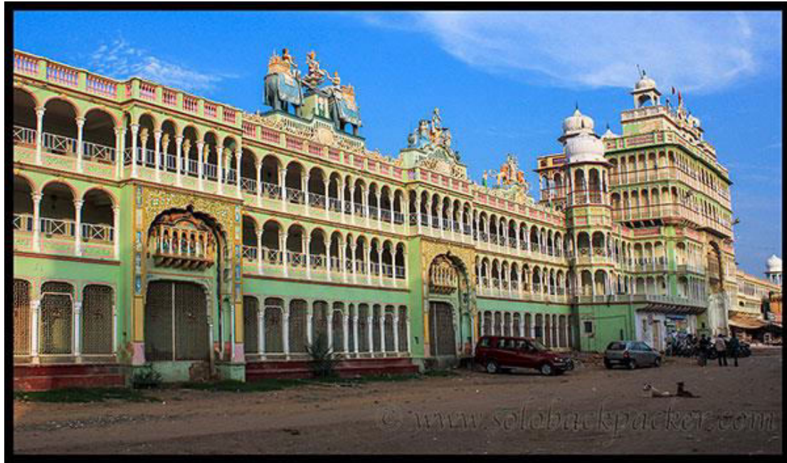
Rani sati temple

The instruments were used in the limit of précised accuracy and chemicals used were of analytical grade. All the water sample were properly labeled as 1, 2, 3, 4, 5, 6, 7, 8, 9, 10 and a record was prepared indicating the source of the sample, location of the source and data of collection. 3 open wells, 3 tube wells and 4 handpumps in different areas were selected for sample collection. [1,2]