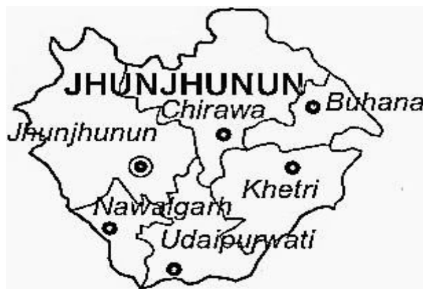
Jhunjhunu district guide map, Rajasthan

The present study provides a detailed description of the chemical criteria of ground water. Ten representative samples of entire study area were collected and analyzed for pH, total dissolved solids (TDS), fluoride, chloride, nitrate, sulphate, total alkalinity, total hardness. The sampling sites were identified and then the samples were collected from different sources after allowing some amount of water to flow out. The samples were collected in clean plastic bottles, which were pre cleaned, dried in dust free environment and sterilized.