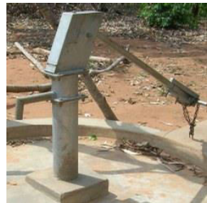
Sampling from handpump