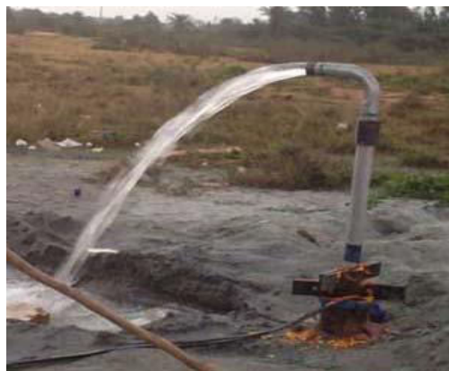
Sampling from bore well

5. Sulphate: The sulphate ion is one of the major anions occurring in natural water. Sulphate in most of the samples was found to be lower than the highest desirable level i.e., 200 mg/L. Sulphate was found in the range of 30 to 80 mg/L, which is also within the limit. Higher values of sulphate may cause intestinal disorder. [7]