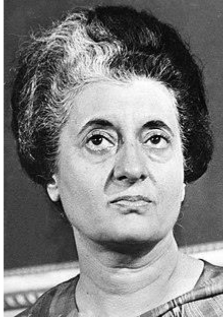
Mrs. Indira Gandhi-our first women prime minister

Though feminists share common commitments to equality between men and women, feminist jurisprudence is not uniform. There are three major schools of thought within feminist jurisprudence.[2]