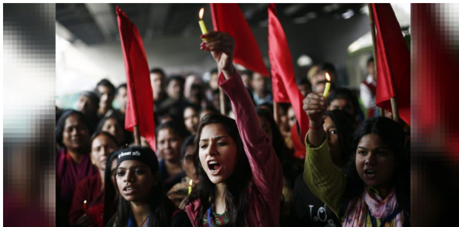
“Mee too campaign”-the fourth wave

The 2012 fatal gang rape of a 23-year-old student in Delhi became a tipping point. An unprecedented number of millennial youth launched a rallying cry for women’s unconditional freedom. They asserted that women have absolute right to their choices, their bodies and to their movement in public spaces at any time of day or night. They challenged outmoded cultural beliefs that women invite sexual violence through their clothes and behavior. By bringing the discourse of freedom, sexuality, choice and desire into the public realm – in the streets and through social media – this agitation forced the government to expand its legal definition of rape, introducing harsher punishment for rapists and criminalizing stalking and voyeurism.