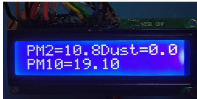
FIGURE 1: when no input is given

This project will be used to measure the particle concentrations of PM2.5, PM10 and dust particle density in the air and the data can be successfully implemented and will be displayed in LCD.