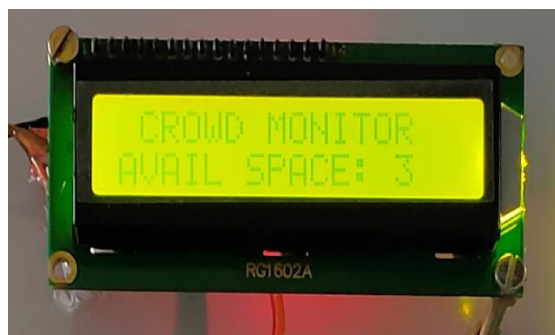
Fig. 2. (b) The available space is displayed in the LCD screen display