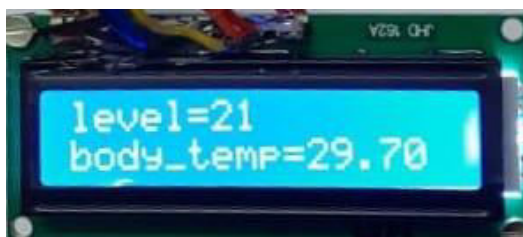
Fig. 3 The body temperature and water level is displayed in the LCD screen display