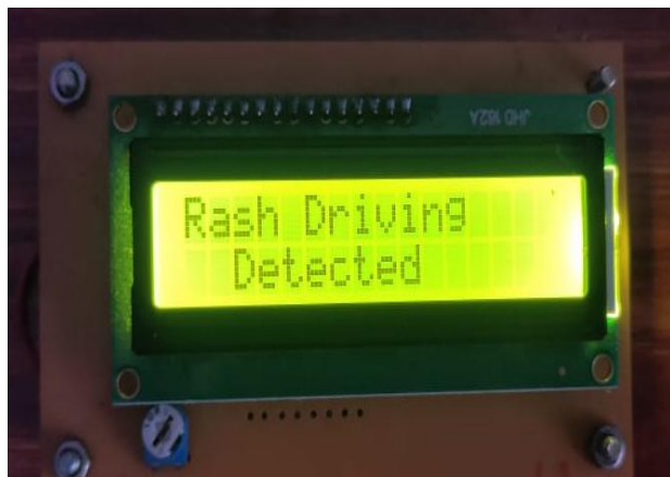
FIGURE : EXPERIMENTAL RESULT