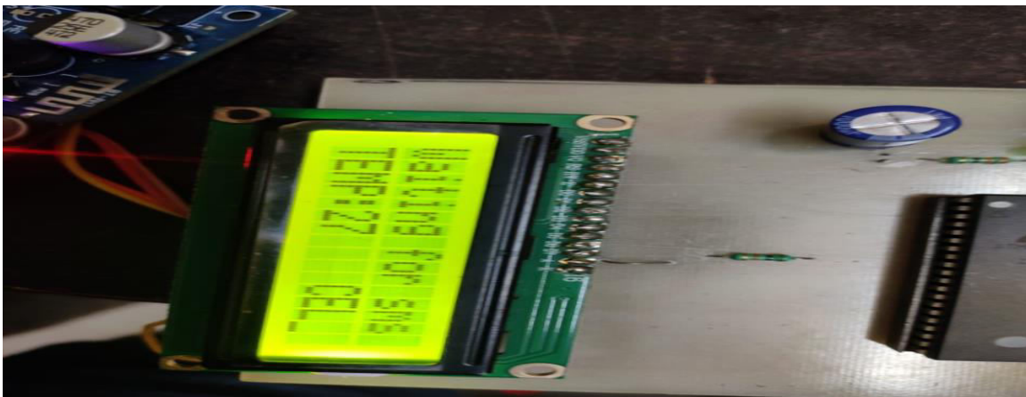
Figure 4.1 Temperature output

The MQ-6 Gas Sensor is a semiconductor-based gas sensor that detects the presence of gas in the atmosphere. They are usually used to detect gas in both households and businesses. In gas sensors, SnO 2 metal oxide is utilised. When SnO 2 is heated to a certain temperature in air, oxygen with a negative charge is absorbed on the crystal surface. As a result, the surface potential acts as a potential barrier to electron flow. In the presence of deoxidizing gas, which lowers the grain boundary barrier height, this potential barrier recognises the sensor's electrical resistance. Due to the lower barrier height, the sensor resistance falls. Figure 4.1 depicts the temperature command's output.