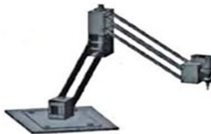
Fig. 1. Robotic Drilling Machine

In rock drilling, the hole is usually not made through a circular cutting motion, though the bit is usually rotated. Instead, the hole is usually made by hammering a drill bit into the hole with quickly repeated short movements. The hammering action can be performed from outside the hole (top-hammer drill) or within the hole (down-the-hole drill, DTH). Drills used for horizontal drilling are called drifter drills. In rare cases, specially-shaped bits are used to cut holes of non-circular cross-section; a square cross-section is possible. Drilled holes are characterized by their sharp edge on the entrance side and the presence of burrs on the exit side (unless they have been removed). Also, the inside of the hole usually has helical feed marks. Drilling may affect the mechanical properties of the work piece by creating low residual stresses around the hole opening and a very thin layer of highly stressed and disturbed material on the newly formed surface. This causes the work piece to become more susceptible to corrosion and crack propagation at the stressed surface. A finish operation may be done to avoid these detrimental conditions. Robotic drilling machine consists of base plate, arm horizontal and vertical, motor, arduino, guider, servomechanism, actuators, and drill bit. It is shown in Fig.1