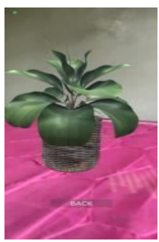
Fig 7 flower pot screenshot

In Fig 6 Google 3D animal is a web-based AR application that is used to project the animals into a devices screen to create an AR experience, because of the hardware usage constraints for the web browserweb-based AR application have less quality and lacks to provide some platform dependent features