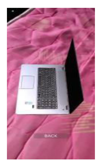
Fig 8 laptop screenshot

Fig 7 and Fig 8 are taken from the application created for this project, an android application created using a game engine(unity3D), native Android application can access the device GPU directly to render the models which result in higher rendering quality and reduced internal latency.