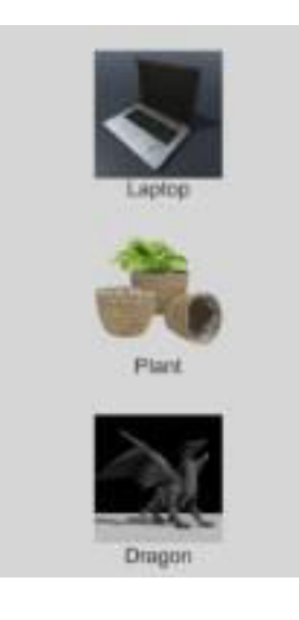
Fig 2 Product selection

Fig 1 shows the architecture of our proposed system, The user opens the AR preview application by clickingon it, there will a list of products available for AR preview. The users have to select the product which they want to see in the AR preview.