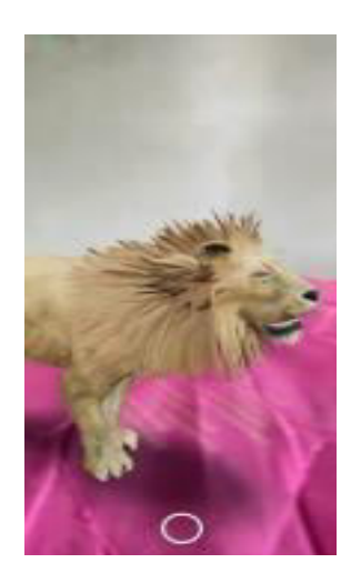
Fig 6 Google 3D animal

This application lets the user preview any e commerce products in an Augmented reality view. Once the user selects a product, the application downloads the respective 3D model from the FTP server. Users can manipulate the 3D model using a hand gesture to rescale, rotate, and move the product to get a better view and idea of the product.