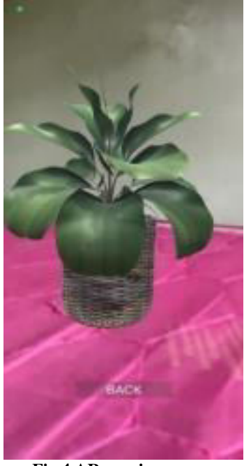
Fig 4 AR preview screen

Fig 4 shows how AR preview screen looks like.