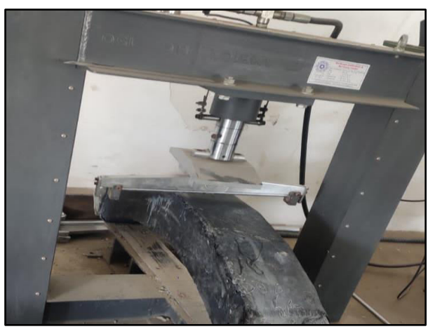
Figure 1c Testing of Specimen