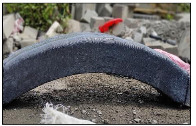
Figure 1b Wrapping of Specimen