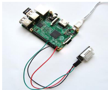
Fig. Required Hardware

The cloud services will analyse the data stored on the cloud. These analytics services are connected with administrator dashboard where the admin have the rights to innovate and transform the representation as well as data requirements. Once the data is analysed, based on the analysis the data will be shared to the SCADA dashboard where the user can check the analysis.