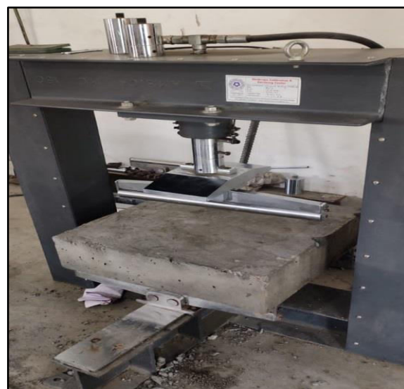
Figure 1b Testing of Specimen