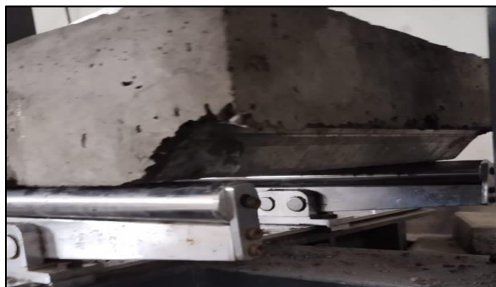
Figure 3b Cracking pattern of composite slab

On the other hand, the failure modes of composite slab can be categorized into 2 major modes under loading as shown in Fig. 3b which are flexural failure at mid span and bond or longitudinal slip failure. A bond failure results in slippage between the concrete and the metal deck, which can result in cancellation of the composite actions at interface. In flexural failure mode, the full steel section can yield in tension before the crushing of concrete in the upper section.