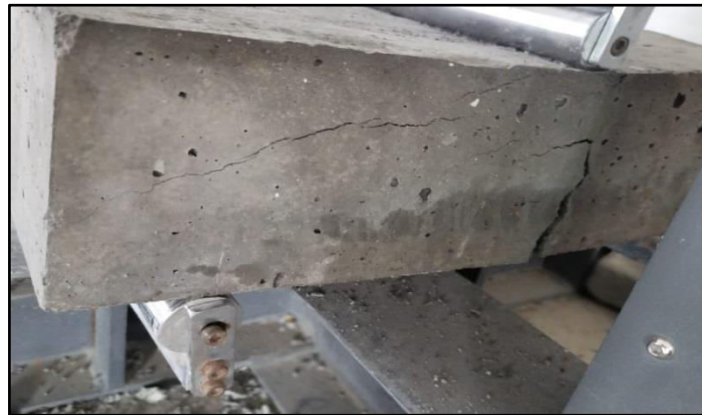
Figure 3a Cracking pattern of conventional slab

On the other hand, the failure modes of composite slab can be categorized into 2 major modes under loading as shown in Fig. 3b which are flexural failure at mid span and bond or longitudinal slip failure. A bond failure results in slippage between the concrete and the metal deck, which can result in cancellation of the composite actions at interface. In flexural failure mode, the full steel section can yield in tension before the crushing of concrete in the upper section.