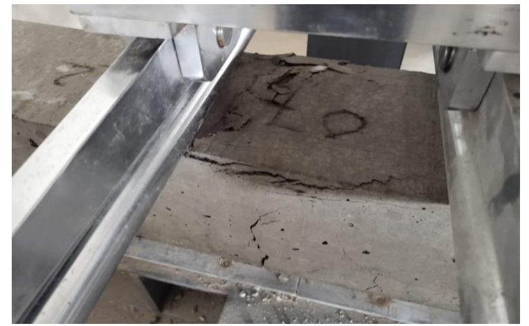
Figure 3b Failure pattern of Reinforced Concrete Composite Beam-1