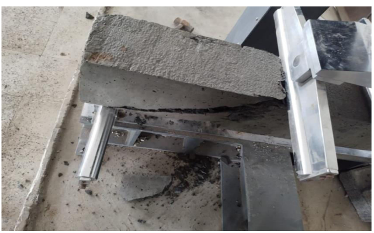
Figure 3a Failure pattern of Reinforced Concrete Beam

It identified that the concrete beam of composite nature has obtained cracks thick and deep at the junction due to irregular strength gain of two different grades of concrete when the specimen was tested on 7 days. Further, during 28 days, the two different grades form good integrity and regular cracks started appearing on the sides similar to that of conventional concrete. It forms in between tension zone and compression zone. The developed crack pattern is illustrated in figure 3b. The crack patterns for RCB on 7 days of curing were shear cracks developed at the end one third portion of the length of the beam with uneven cracks at the centre portion of the beam. On the other hand, RCCB developed cracks in the region where bonding between the two different grades was present. The cracks were deep enough and developed at the point of application of load and extended up to the ends. Following figure 3a and 3b shows the failure pattern for Reinforced Concrete Beam and Reinforced Concrete Composite beam at 7 days of curing period.