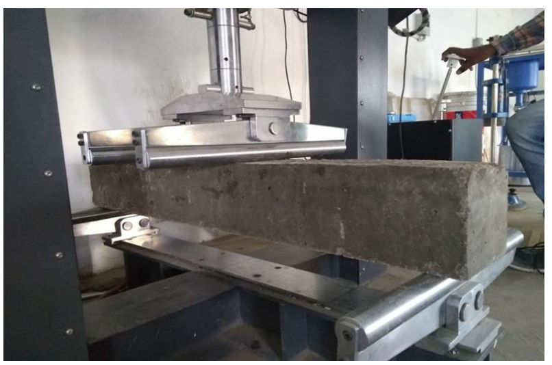
Figure 1b Testing of Specimen