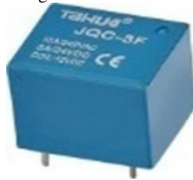
Fig -4 Relay

A relay is an electrically operated switch . Many relays use an electromagnet to operate a switching mechanism mechanically, but other operating principles are also used. Relays are used where it is necessary to control a circuit by a low-power signal (with complete electrical isolation between control and controlled circuits), or where several circuits must be controlled by one signal.