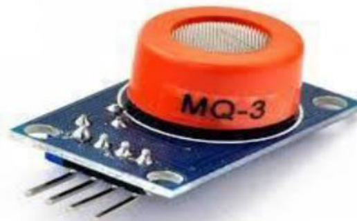
Fig -6: Measurement of CO :(MQ-3)