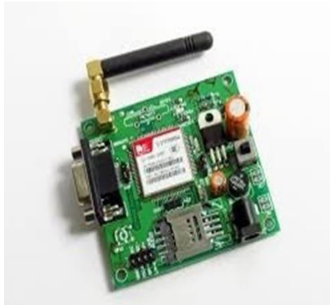
Fig -7: GSM