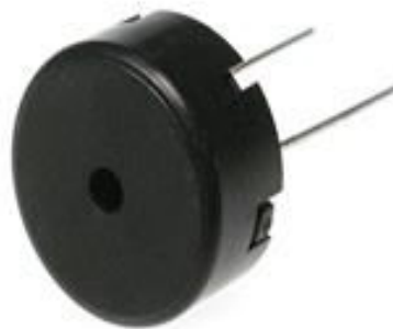
Fig -8: Buzzer

A buzzer or beeper is an audio signal device, which may be mechanical , electromechanical , or piezoelectric . Typical uses of buzzers and beepers include alarm devices , timers and confirmation of user input such as a mouse click or keystroke. If embedded system is misplaced from dashboard, the IR sensor becomes active. The signal is sent to microcontroller to ring the buzzer. It is connected to the pin no.28 of microcontroller.