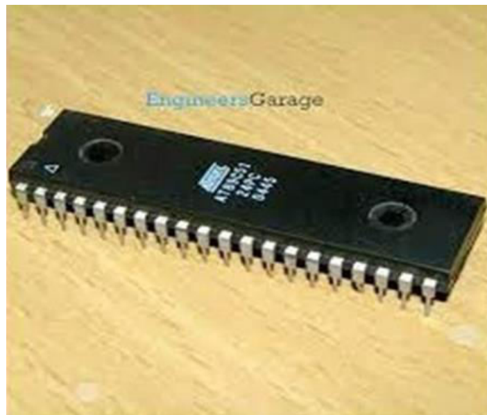
Fig -2: Microcontroller 89S52

It is a low-power, high performance CMOS 8-bit microcontroller with 8KB of Flash Programmable and Erasable Read Only Memory (PEROM). THE device is manufactured using Atmel's high-density nonvolatile memory technology and is compatible with the MCS-51T instruction set and pin out. The on-chip Flash allows the program memory to be reprogrammed in-system or by a conventional nonvolatile memory programmer. By combining a versatile 8-bit CPU with Flash on a monolithic chip, the Atmel AT89c51 is a powerful.