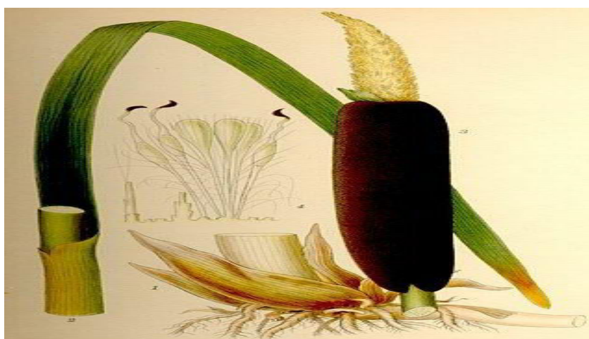
1-picture. Formation of fibers of the rogoz plant

A perennial plant blooming in June. First, at the ends of the stems appear FIR-like heads, thickening in the form of a tassel, and then the flower buds begin to grow and thicken, grow in size and acquire a bright yellow hue due to the skis contained in them. As the seeds develop and grow, the yellow Horn becomes dark brown, and by autumn it becomes soft and velvety fiber. From each seed, at least 10-20 turns out a very delicate fiber.