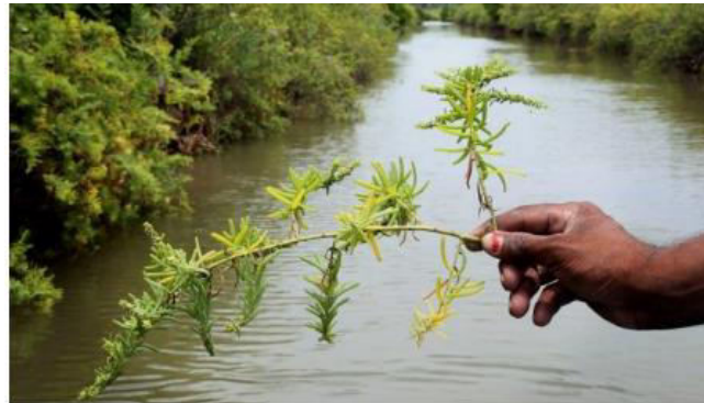
Figure1.2: Selection of Trees for Green Belt