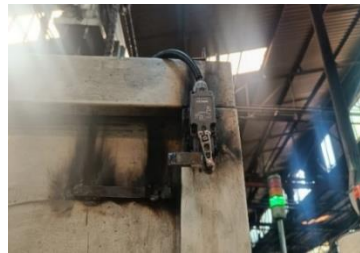
Fig. 1. (a) Door limit switch is deployed on the machine's door

The door limit switch performs a major and crucial role in terms of safety. If the door limit switch is typically open, the machine will not begin the cycle, and a warning will appear on the HMI panel, indicating "The door limit switch is faulty; please close the door and recheck I8.2"