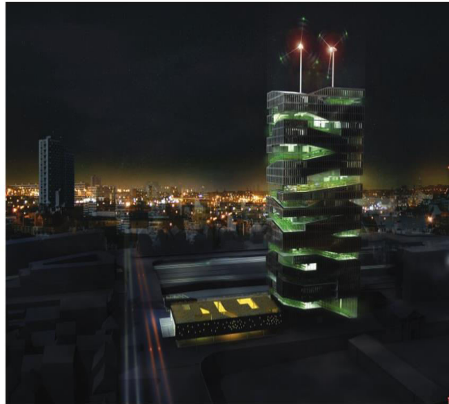
Figure 2: The Living Tower is an urban vertical farm concept associated with a residential and business campus ©SOA Architects [6]

A study [13] conducts a literature review to discuss biophilic design as a theoretical framework to interpret ‘nature’ in architecture. The review identifies and compares the key frameworks of biophilic design and explains their major elements. The benefits were further analyzed (e.g., enhance health, well-being, productivity, biodiversity, and circularity) of biophilic design in achieving sustainability, as framed through the UN Sustainable Development Goals. The results indicate that biophilic design is more complex and richer than the mere application of vegetation in buildings; it broadens the variety by encompassing different types of nature from physical, sensory, metaphorical, morphological, material, and to the spiritual. Moreover, knowledge gaps are identified to motivate future research and critical reflections on biophilic design practices.