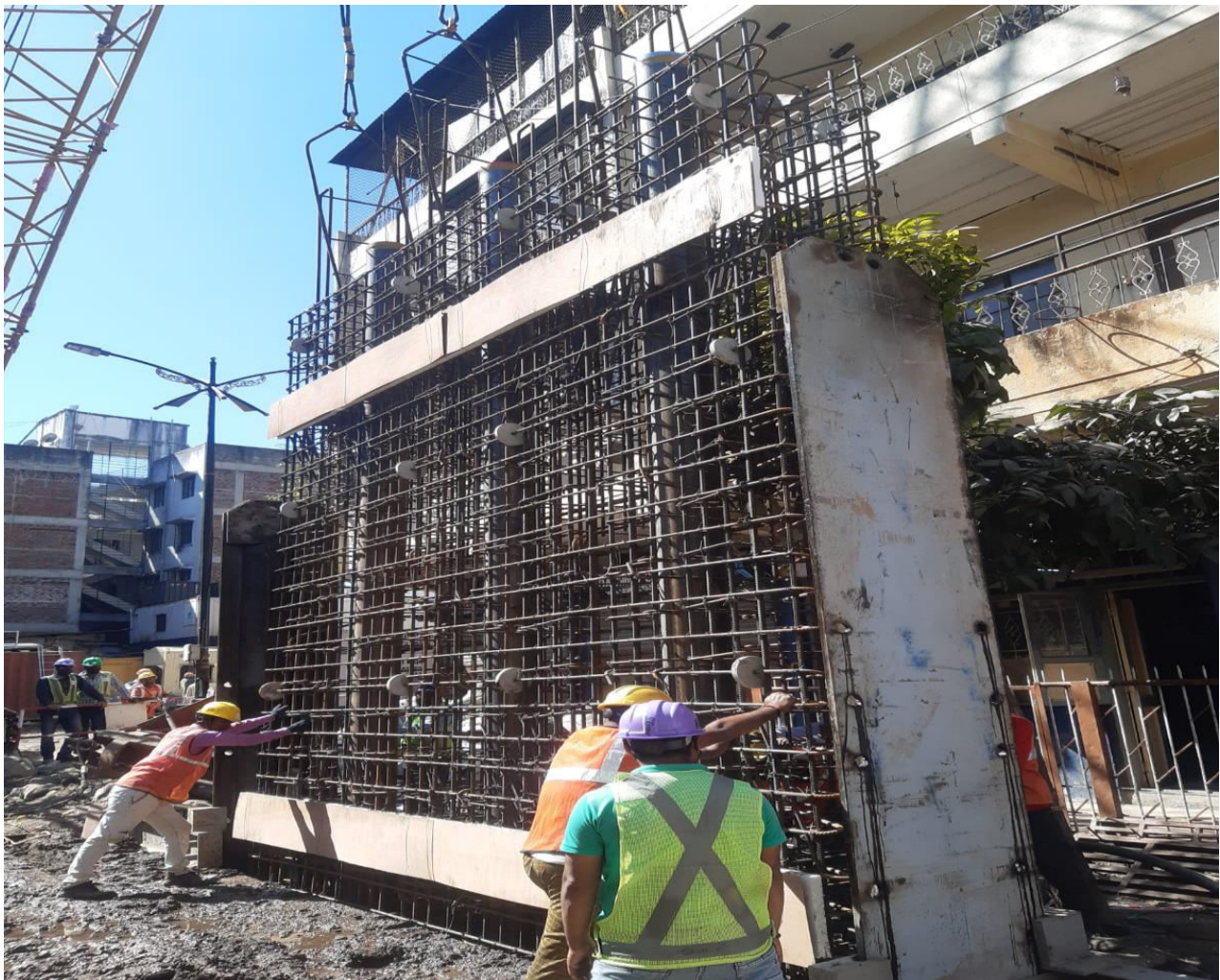
Figure 2 - D-Wall Construction at Budhwar Peth Site