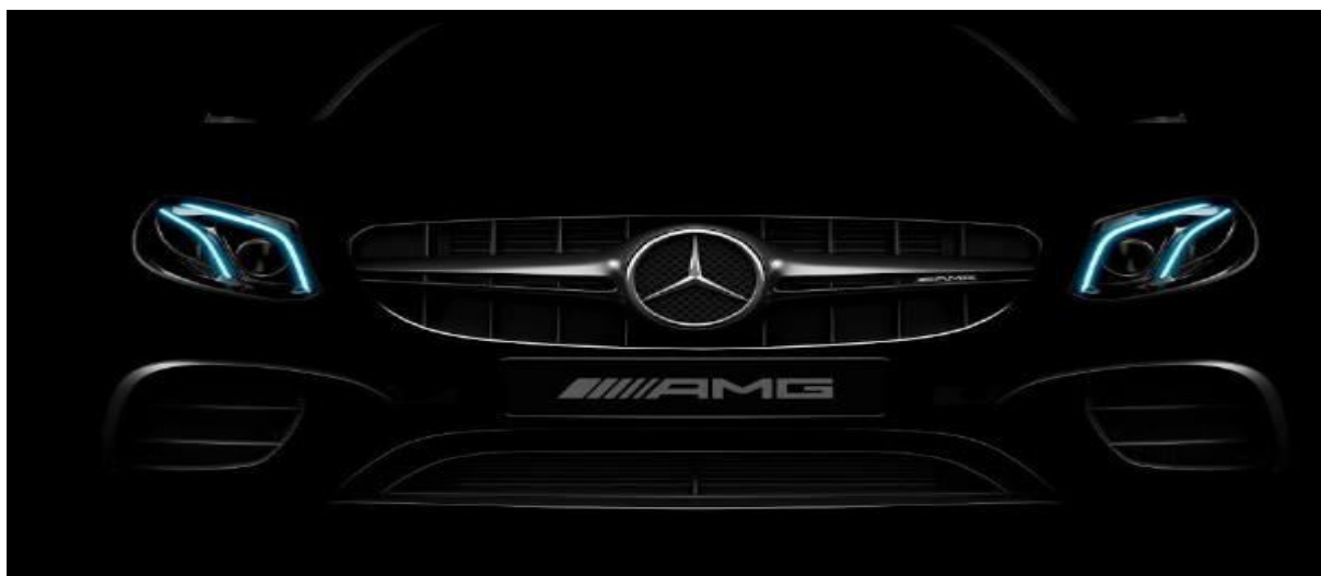
Fig.1 Mercedes Benz MayBach

A subfield of computer science called artificial intelligence aims to replicate human intellect in a machine. Algorithms drive AI systems, which employ methods like deep learning and machine learning to display "intelligent" behaviour. Outside of autonomous driving, artificial intelligence (AI) is a crucial tool for Mercedes Benz. We create new features based on machine learning, for example, for upcoming automobiles and mobility services. Intelligent assistance systems let us experience a new kind of AI-powered individual support in our professional lives. [1] .