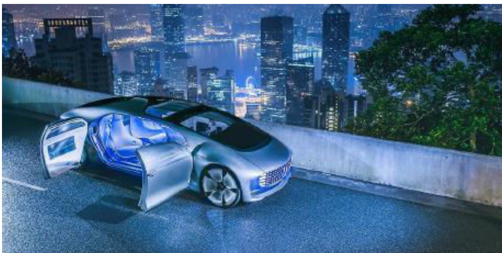
Fig.4 The future of Intelligent driving technology

Since the invention of the automobile in 1886, we have been setting standards in vehicle safety with our technical innovations. With more and more new and optimized safety systems, we continue to refine the field of safety in road traffic. Our "Intelligent Drive" assistance systems and their increasing networking are ground-breaking – and a milestone toward autonomous and accident-free driving. People from all over the world put their trust in Mercedes-Benz for the things which are most valuable to them: In our vehicles, people get married, children are born, lives are saved, and grandchildren are chauffeured. In short: Every day, millions of people rely on the fact that they and their loved ones are safe in a Mercedes. And for this, our developers give their best worldwide [8].