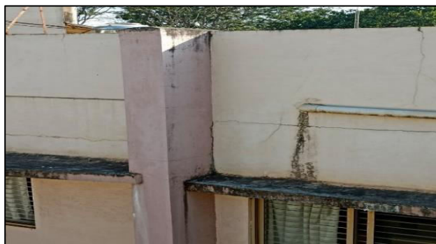
Fig.3 representation of horizontal cracks

Horizontal cracks: Occurs near the beam-column joint and column face where tensile stress is high. Columns with sufficient moment capacity, insufficient reinforcement, or the disposition of the installed reinforcement are prone to horizontal cracking; due to shear force and direct load and uniaxial bending