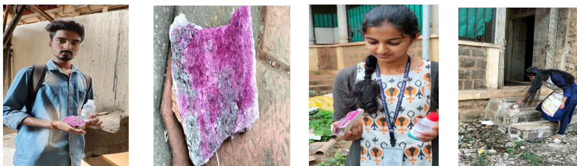
Fig. 6 Carbonation Test