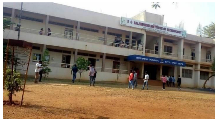
Fig.1 S.G.B.I.T CAMPUS

Vertical cracks: These cracks can indicate that structural components such as bricks or blocks have failed, and so can be a sign of significant stress in the building structure.