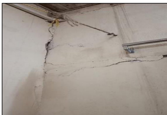
Fig.4 representation of diagonal cracks

The main cause of diagonal cracks in concrete columns is the insufficient bearing capacity of the columns; insufficient cross-section and insufficient reinforcing steel. It can appear anywhere in the height. And it runs diagonally across a section of uniform thickness