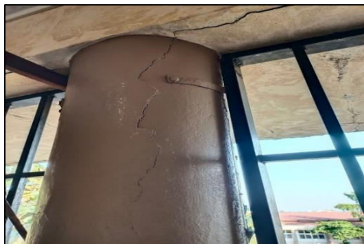
Fig.2 representation of vertical cracks