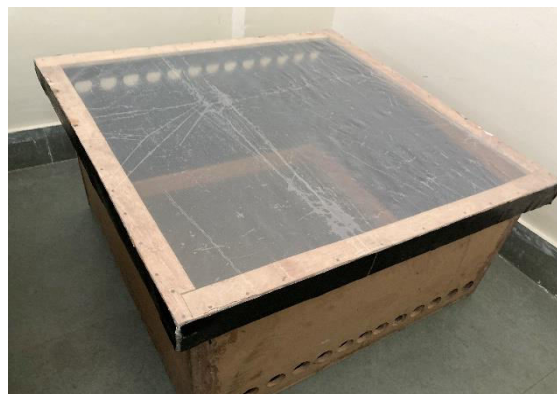
Fig 2 – Final assembly of the solar dryer

The construction of this solar dryer is in the form of a box covered with a tarpaulin sheet, operating on natural convection. The body is made up of MDF sheets with holes drilled on the opposite sides to facilitate air ventilation. The box is painted black on the inside to enhance heating due to radiation. There is an upper frame made up of wooden planks with tarpaulin sheet attached on the top to enhance passage of sunlight. Internal frame is also made of wooden planks with stainless steel net attached. This platform is used to place food products.