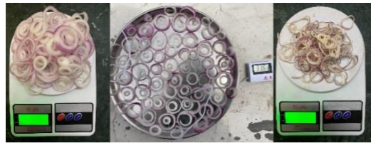
Fig 5 – Sun drying of Onion

Drying using solar dryer: Food products are sliced into the form of chips and initially weighed. These chips are then put into the drying chamber of the solar dryer. After all the moisture has been removed, the chips are weighed again and time required is noted.