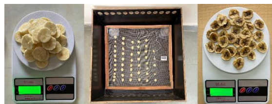
Fig 6 – Drying with solar dryer of Banana

Drying using solar dryer: Food products are sliced into the form of chips and initially weighed. These chips are then put into the drying chamber of the solar dryer. After all the moisture has been removed, the chips are weighed again and time required is noted.