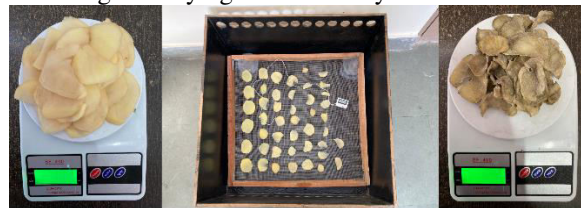
Fig 7 – Drying with solar dryer of Potato