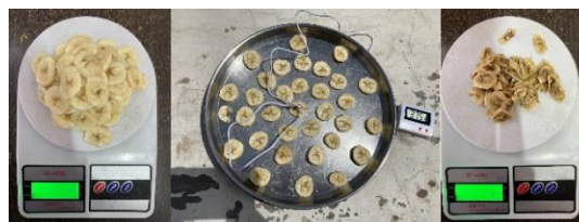
Fig 3 – Sun drying of Banana

Conventional sun drying: Food products are sliced into the form of chips and initially weighed. These chips are then put into direct sunlight on a plate. After all the moisture has been removed, the chips are weighed again and time required is noted.