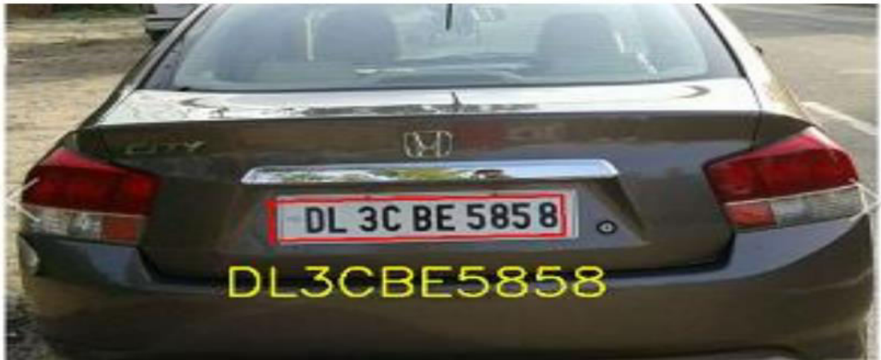
16. Printing the plate number.