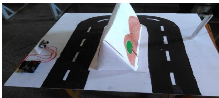
Fig.3 Fixing the circuit to the model

STEP 4: Fixing the circuit to the model i.e., fixing microcontroller Arduino UNO, ultrasonic sensor and LED light to the model of curve road as shown in figure below.