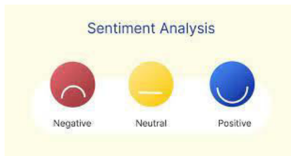
Fig 2. Sentiment Analysis

Natural language processing (NLP) is a subfield of linguistics, computer science, and artificial intelligence concerned with the interactions between computers and human language, in particular how to program computers to process and analyse large amounts of natural language data. The goal is a computer capable of "understanding" the contents of documents, including the contextual nuances of the language within them. The technology can then accurately extract information and insights contained in the documents as well as categorize and organize the documents themselves.[5]