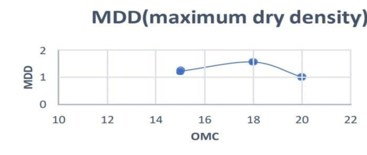
Fig1. Compaction Test On Black Cotton Soil