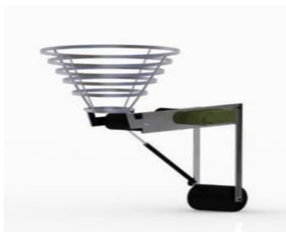
Figure 2: 3D model of the proposed system

An inventive solution to the labour-intensive task of arecanut harvesting looks to be the proposed design for an automated arecanut bunch plucking machine. The machine may be powered by electricity without the need for manual labour, which can lower total costs and improve areca nut harvesting efficiency. Better control and traction over the machine's movement on the tree trunk can also be achieved by using a Teflon wheel and geared motor in the climbing mechanism. Additionally, the machine's adaptability to different sizes of areca nut trees can be increased by the suspension system for wheel adjustment for different radius of the tree. The machine that assists in harvesting the areca nut bunches must include the plucking tool. Although it is unclear from the description whether the plucking tool is made to cause the least amount of harm to the tree, this is an important aspect that must be taken into account for the longevity of the areca nut trees.