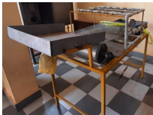
Fig.2 working model

The 42×24×28 inch (L×W×H) steel square tube and L angle frame is constructed of. which support the other washing machine components. the conveyor that transports fruits and vegetables from the hopper to the collection chamber. The conveyor made with steel mesh. The instrument used to measure pressure, the pressure gauge. The water droplets were sprayed using nozzles with a 1mm diameter. These nozzles are situated in the middle and above the conveyor. As a result, the conveyor rotates slowly thanks to the geared motor, which has a 60 rpm speed. This machine is mostly used to wash produce before it is sold.