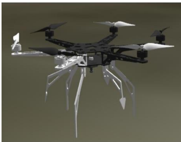
Fig.1 : Drone Detection from Images