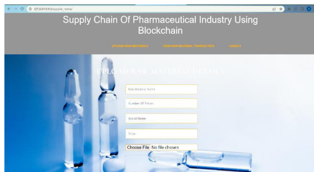
Figure 3: Supplier uploading raw materials

We didn't use the cloud in this because the main agenda behind this project is to store data in a highly secured area as leakage of data from cloud storage is common and we prefer a decentralized data storage facility. Instead, we used IPFS based storage model. Only the hash of the file is stored in the blockchain and the files of the certificate are stored in IPFS. Calculation of block header hash is mainly based on IPFS hash. Once a fraudulent node wants to tamper with the data which has already been entered its IPFS hash also changes. Thus, an invalid block won't be validated by Blockchain. In this storage space is also optimized because of the use of hash itself.