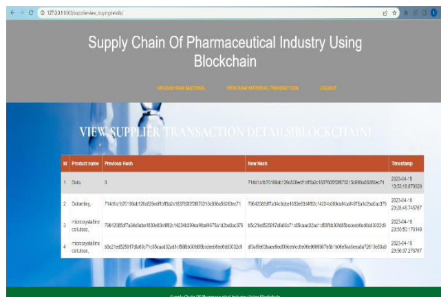
Figure 4: Supplier transaction details

Supplier with proper login credentials can upload the raw materials by providing details of the raw materials like name of the raw material, number of pieces, brand name, price and image file can be chosen as shown in the Figure3 .