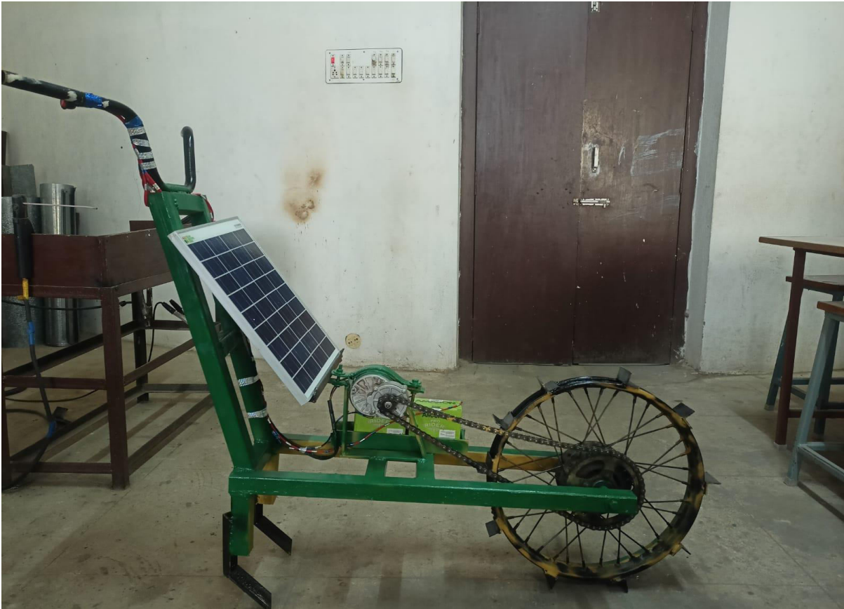
FIG:- SOLAR POWER TILLER