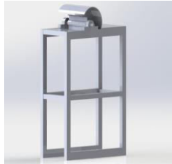
Figure no 2: Construction of Frame

The frame is used to support all the components. Material of frame is cast iron and height up to 1m.