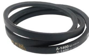
Figure no 5: Belt