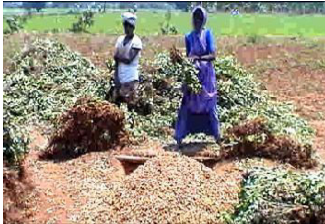
Figure no 1: Traditional method of ground nut threshing.