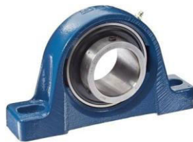
Figure no 6: Bearing

A bearing is a machine element that constrains relative Motion to only the desired motion, and reduces friction between moving parts. The design of the bearing may, for example, provide for free linear movement of the moving part or for free rotation around a fixed axis; or, it may prevent a motion by controlling the vectors of normal forces that bear on the moving parts. Many bearings also facilitate the desired motion as much as possible, such as by minimizing friction. The ball bearing is shown in the figure.