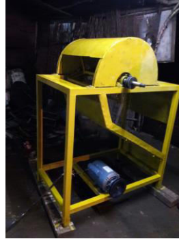
Figure no 9: Assembly of project

The assembly of the project was done as follows: