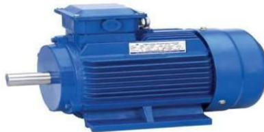
Figure no 3: Electric Motor

The motor are used to rotate the shaft at required speed to remove the pods. Motor and shaft are connected by use of belt.