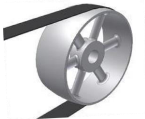
Figure no 4: Pulley

A pulley is a wheel on an axle or shaft that is designed to support movement and change of direction of a taut cable or belt along its circumference. Pulleys are used in a variety of ways to lift loads, apply forces, and to transmit power.