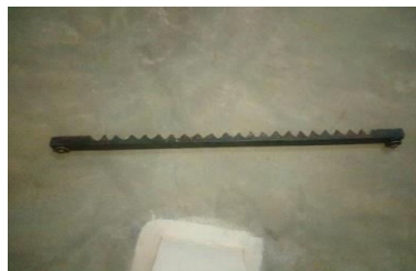
Figure no 7: Cutting plate

A Cutting plate consists of V shape teeth for separating the groundnut pods from the plant. Plate contains two holes at the ends. Plate is attached with the shaft using nut and bolts for any replacement if necessary. A shaft contains two plate, they are fitted with angle 180°. A plate is continuously rotated with the help of shaft. Groundnut plants are feed perpendicular to the rotation of plates. The photographic view of cutting plate is shown in the figure 5.6