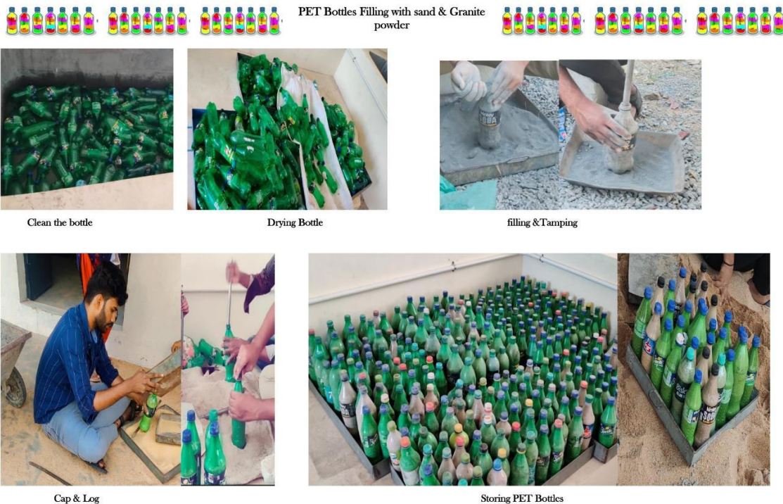
Figure 1. PET bottles