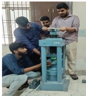
Figure 2. Compressive Strength on PET bottles