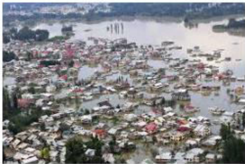
FIG 1: Image at the time of disaster

Flooding likewise had significant effect on family unit level food stocks and glimmer floods additionally washed away family unit resources.