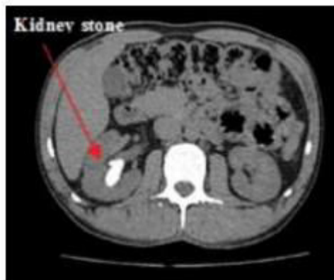
Figure 4.3 Image Segmentation

Image segmentation is the process of dividing a digital image into sets of pixels which are also known as super pixels. The ROI model is usually used to identify the abnormal region based on clusters and centroids