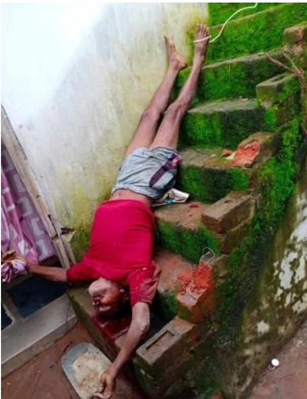
Fig. 01: Position of dead body of victim at crime scene.