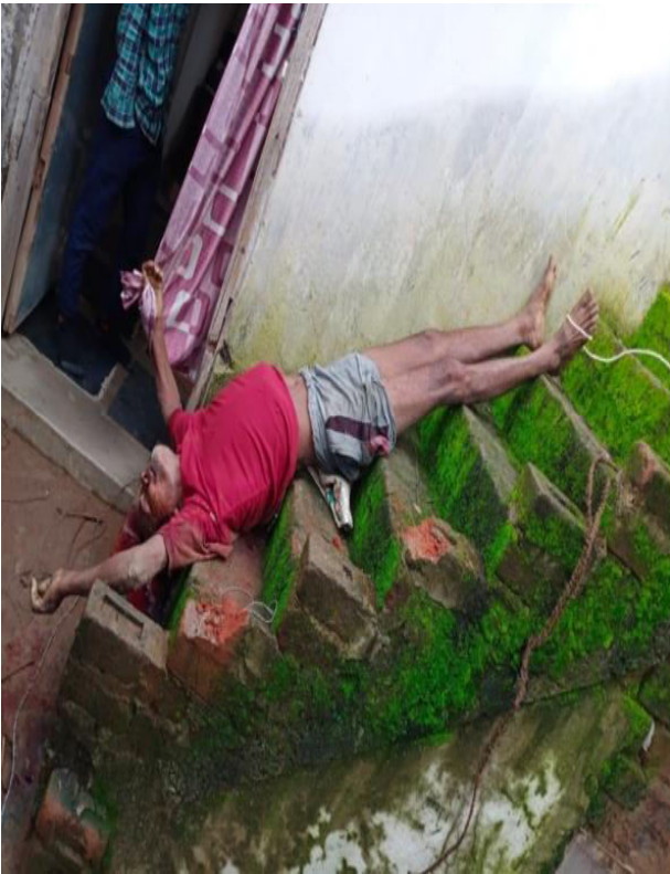
Fig. 03: Crime scene lateral viewwith Body .