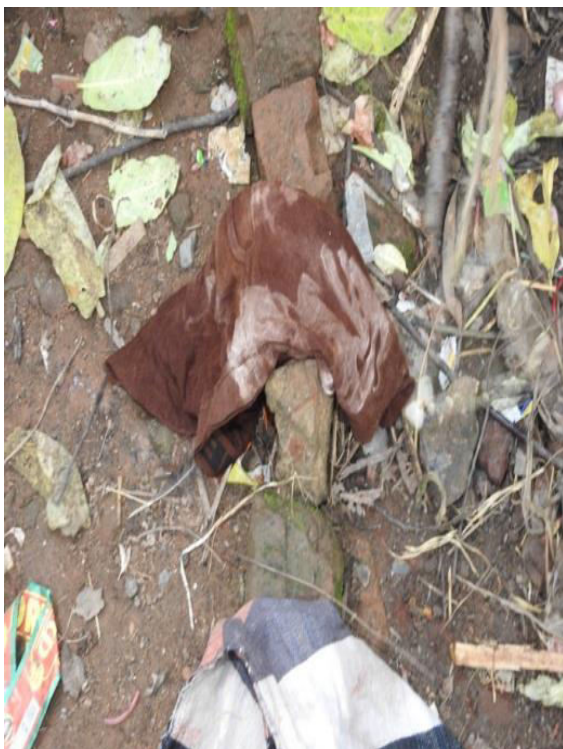
Fig. 09: White color felt underwear.