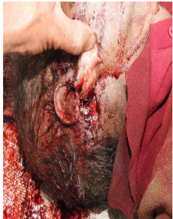
Fig. 06: Circular wound near to ear.