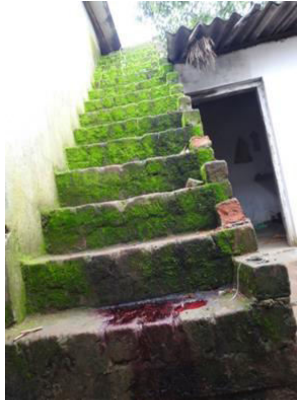
Fig. 04: Blood spot found in the first step of stair.