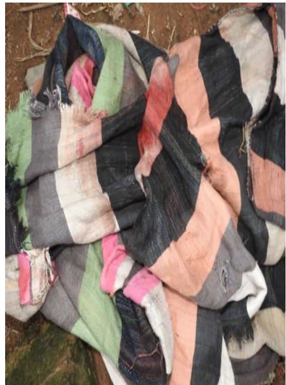
Fig. 10: Blood stained bed sheet.