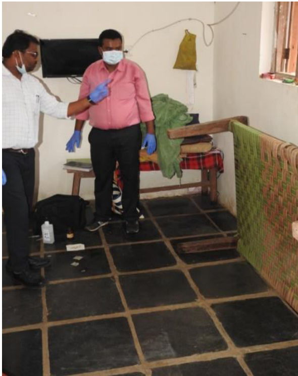
Fig. 07: Cleaned floor of room.