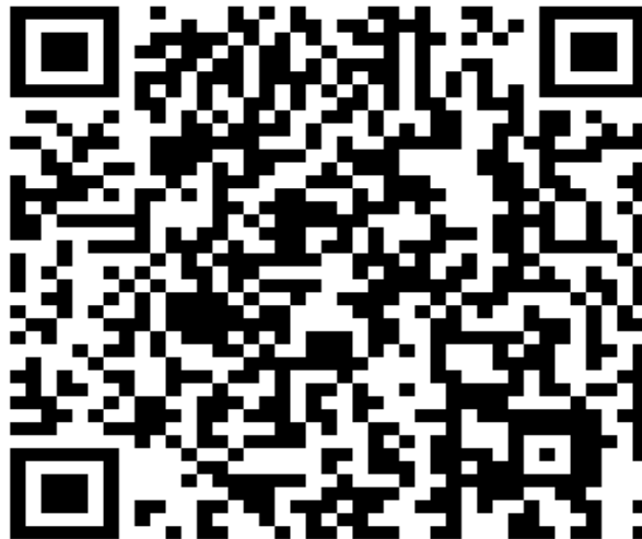
Fig 1: Bar Code

A QR Code (abbreviated from Quick Response Code) as shown in Fig-2 is a two-dimensional barcode consisting of a black and white pixel pattern which allows encoding up to a few hundred characters [2]. QR code is the trademark for a type of matrix barcode first designed for the automotive industry in Japan. QR codes can be used with many mobile device operating systems like Android Operating System and iOS (iphone Operating System) [3]. These devices support URL redirection, which allows QR codes to send metadata to existing applications on the device. Many paid or free apps are available with the ability to scan the codes and hard-link to external applications.