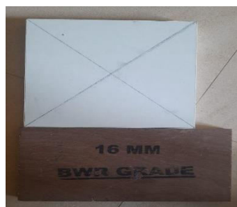
Fig 6 Base

A submersible pump (or electric submersible pump (ESP)) is a device that features a hermetically sealed motor tightly coupled to the pump body. The entire assembly is immersed in the liquid to be pumped. The main advantage of this type of pump is that it prevents pump cavitation, a problem associated with a large difference in height between the pump and the liquid surface. Unlike jet pumps, which create a vacuum and rely on atmospheric pressure, submersible pumps push liquid to the surface. Submersibles use pressurized fluid from the surface to power a hydraulic motor instead of an electric motor downhole, and are used in heavy oil applications with heated water as the propulsion fluid.