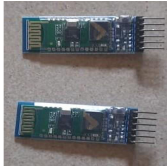
Fig 4 Bluetooth Module