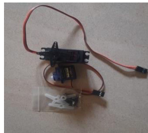
Fig 2 Servo-motor

The Arduino UNO is an ATmega328P-based microcontroller board. It contains 6 analogue inputs, a 16 MHz ceramic resonator, 14 digital input/output pins (six of which can be used as PWM outputs), a USB port, a power jack, an ICSP header, and a reset button. It comes with everything required to support the microcontroller; to get started, just use a USB cable to connect it to a computer or an AC-to-DC adapter or battery.