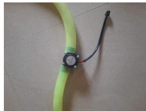
Fig 8 Flowrate Sensor

This Faithfull Adjustable Spray Nozzle can be adjusted from a fine spray to a powerful jet by quickly twisting the brass nozzle end. The spray pattern can be set to a fine spray for delicate garden plants or a powerful jet for patio, patio or vehicle cleaning. Made from high quality solid brass. Suitable for use with all 12.5mm (1/2") ID hose and compatible with all other UK water fittings.