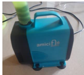
Fig 4 Pump

A submersible pump (or electric submersible pump (ESP)) is a device that features a hermetically sealed motor tightly coupled to the pump body. The entire assembly is immersed in the liquid to be pumped. The main advantage of this type of pump is that it prevents pump cavitation, a problem associated with a large difference in height between the pump and the liquid surface. Unlike jet pumps, which create a vacuum and rely on atmospheric pressure, submersible pumps push liquid to the surface. Submersibles use pressurized fluid from the surface to power a hydraulic motor instead of an electric motor downhole, and are used in heavy oil applications with heated water as the propulsion fluid.