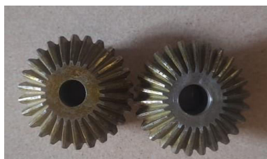
Fig 3 Bevel Gear

A servo motor is a kind of motor that has extremely precise rotational capabilities. This type of motor typically has a control circuit that gives feedback on the motor shaft's present location. This feedback enables the servo motors to rotate very precisely. A servo motor is used to rotate an object at predetermined angles or distances. It consists only of a straightforward motor that drives a servo mechanism.