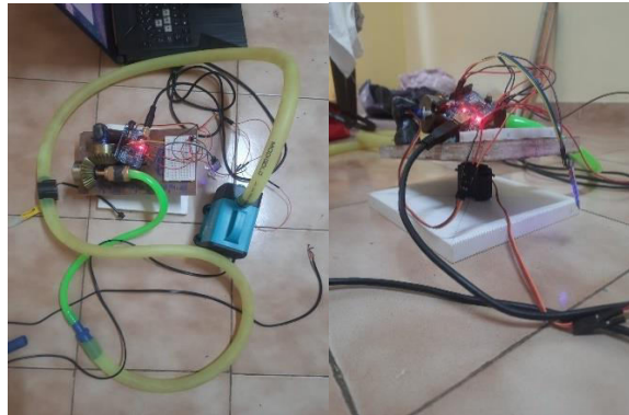
Fig 10 and 12 AUTOMATED NOZZLE SYSTEM TO SPRAY IN AGRICULTURE USE

Automated nozzle system to spray in agriculture use has been designed and the prototype has been developed