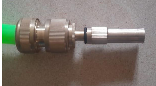
Fig 7 Nozzle

This is the platform for the Nozzle to stand and rotate