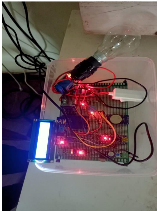
Final Output Diagram