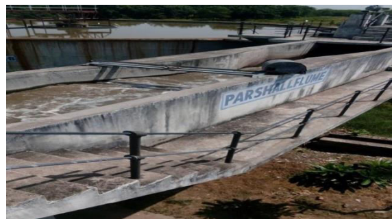
Figure.5 view in Parashall Flume