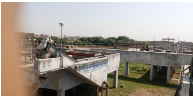
Figure.4. View of mechanism of grit separator

After removing the solid waste from water, it transfers to grit chamber for removing the grit; the grit obtained from this chamber is highly nutritious for crops. The chamber is trapezoidal in shape for easy collection of grit. The whole process is fully automatic. After grit separation, the water is send to primary clarifier for further processing through Parshall Flume for regulating the flow velocity. This is generally made at an angle varies from 1 - 12 degree in STPs. By this mechanism, we are capable to increase the retention period in primary clarifie.