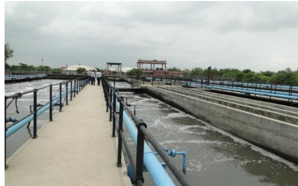
Figure.7. Aeration Tank

In primary clarifier, the sludge remove through gravity separation method. Then it transfers to secondary clarifier passing via aeration tank for activated sludge process. In aeration tank, oxygen is providing with the help of blower for survival of bacteria. A small quantity of sludge returned from secondary clarifier to aeration tank for activated sludge process. Air blowers are being operated with variable frequency drive (VFD). Man Machine Interface (MMI) is provided through. From aeration tank, the wastewater goes to secondary clarifier. This is the final treatment process for water in this plant. The water from here opens to Amanisah runnel finally.