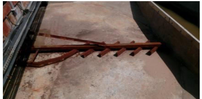
Figure.2. Showing automated screening Figure.3. Showing the inner view of grit Removal

After removing the solid waste from water, it transfers to grit chamber for removing the grit; the grit obtained from this chamber is highly nutritious for crops. The chamber is trapezoidal in shape for easy collection of grit. The whole process is fully automatic. After grit separation, the water is send to primary clarifier for further processing through Parshall Flume for regulating the flow velocity. This is generally made at an angle varies from 1 - 12 degree in STPs. By this mechanism, we are capable to increase the retention period in primary clarifie.