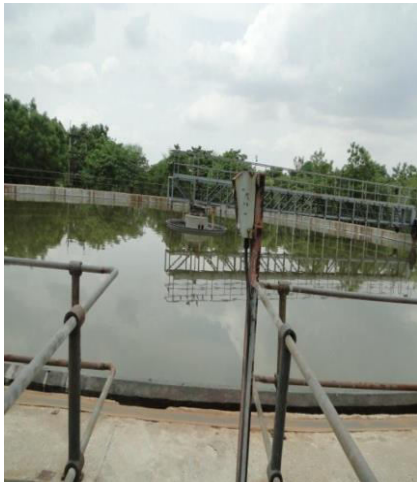
Figure.8. Secondary clarifier

The sludge collected at different steps of process sent to the sump and then to the digester dome. The sludge is dewatered by using centrifugal pumps and the thickened sludge is sent to dome for anaerobic digestion. This process gives biogas and digested sludge, which use as manure by local farmers. The gas produce is using for revenue collection. The gas sent to CNG bottling plant, which gives them cost price of 6.50 RSPNm 3 . For smooth running of plant and follow the BIS standards for treated water, lab is setup on the STP site. The laboratory is fully furnished and all necessary equipment's for testing water is available here. In this laboratory, the water is testing at every stage for ensuring the health of the STP.