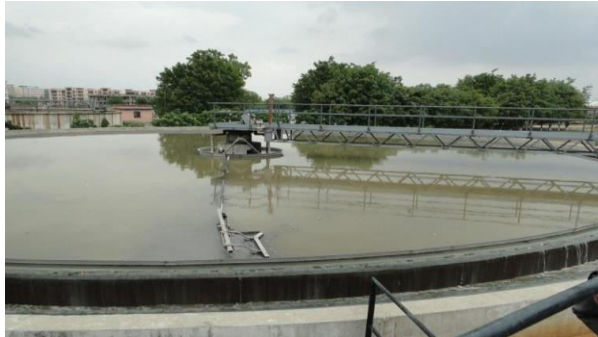
Figure.6. Primary Clarifier