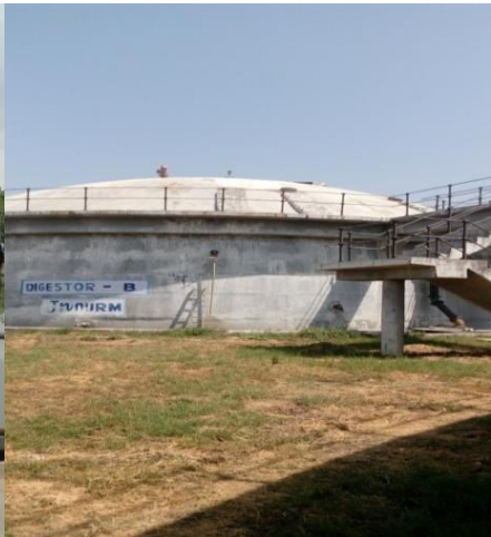
Figure.9. View of sludge digester