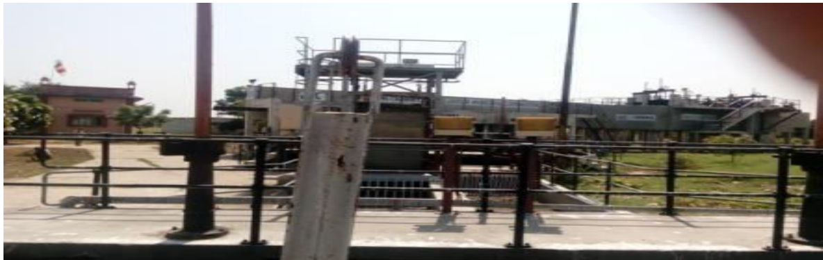
Figure.1. Inlet section of STP

This type of STP, can also be termed as energy saver of a country. As it recharges the groundwater, flow freely and be used for irrigating purposes. The STP of Delawas consist inlet section, which is common for both phase of STP. The raw sewage first collects here. After commencement of water in inlet section it is screened through automated screens. Screens are inclined at an angle of 45 degree.