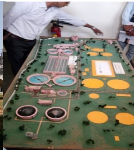
Figure.10. STP model

A model of the whole plant is also available at the site for point of study or knowing the whole process of STP. The authors when rush to the site are welcomed and introduced first by model before actual prototype. The model situation is in office building.