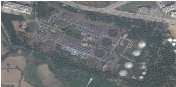
Figure.11. Satellite image of the plant

The study area is confined to STP Delawas, Pratap Nagar, sector 28, Jaipur and nearby area for mass survey through goggle form. The data collected from STP office is useful to analyze rather the treated water fit for any other use or not and relate this result to the result obtained from the online survey through goggle form in the area to solve out the problem without harming environment and even not breaking sentiments of locals.