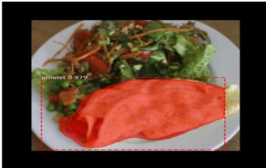
Fig.2: Mask output of omelet

We use instance segmentation to create a pixel wise mask of object in the image. This technique gives us more granular understanding of the food data in the image. Here we use Mask R-CNN for image segmentation which used ROI and IOU to generate bounding boxes, provide labels and mask.As in figure 2. Bounding box is created across the identified food item and label omelet is assigned to the food item.