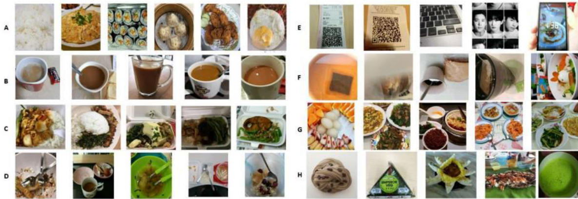
Fig:- Sample food images

• Poor Feedback Quality. It is possible that users may not have the knowledge of food item and may give an arbitrary feedback. They may also be intending to "play" around with the technology and intentionally giving a wrong feedback. Next, we will explore some of these factors through case studies. Analysis of User Queries. We first look at some of the queries sent by users, and identify some of the key properties. We show several examples in Figure , where we have categorized them into 8 categories based on the associated challenges. While several queries are easy to classify (A), there are many challenges including inter-class similarity (B), intra-class diversity (C), incomplete food (D), non-food (E), poorly taken photos (F), multiple food items (G), and unknown foods (H). Detailed descriptions are in the caption. Query Images vs Our Dataset. Here we present a couple of case studies based on Food AI behaviour we wanted to investigate.