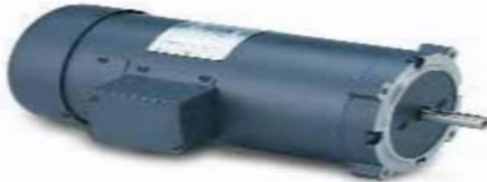
Fig. Dc Motor

DC motors are electric motors that are powered by direct current (DC), such as from a battery or DC power supply. Their commutation can be brushed or brushless. The speed of a brushed DC motor can be controlled by changing the voltage alone. By contrast, an AC motor is powered by alternating current (AC) which is defined by both a voltage and a frequency. Consequently, motors that are powered by AC require a change in frequency to change speed, involving more complex and costly speed control. This makes DC motors better suited for equipment ranging from 12VDC systems in automobiles to conveyor motors, both which require fine speed control for a range of speeds above and below the rated speeds. When selecting DC motors, industrial buyers need to identify the key performance specifications, determine design and size requirements, and consider the environmental requirements of their application. This selection guide is designed to help with this process.