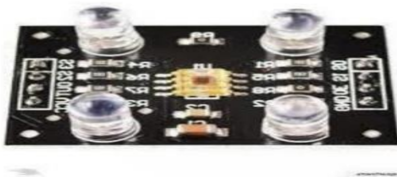
Fig. Colour Sensor TCS230

The TCS230 is a programmable color sensing module equipped with GY-31 light-to-frequency converter that combines configurable 8x8 silicon photodiode array as single monolithic CMOS integrated circuit. The output is a square wave (50 percentage duty cycles) with frequency directly proportional to light intensity (irradiance). The full scale output frequency can be scaled by one of three preset values via two control input pins. Digital inputs and digital output allow direct interface to a microcontroller or other logic circuitry. Output enable (OE) places the output in the high impedance state for multiple units sharing of a microcontroller input line. The light-to-frequency converter reads an 8 x 8 array of photodiodes. Sixteen photodiodes have blue filters, 16 photodiodes have green filters, 16 photodiodes have red filters, and 16 photodiodes are clear with no filters. The four types (colors) of photodiodes are inter-digitized to minimize the effect of non-uniformity of incident irradiance. All 16 photodiodes of the same color are connected in parallel and which type of photodiode the device uses during operation is pin-selectable. Photodiodes are 120 mm x 120 mm in size and are on 144-mm center.