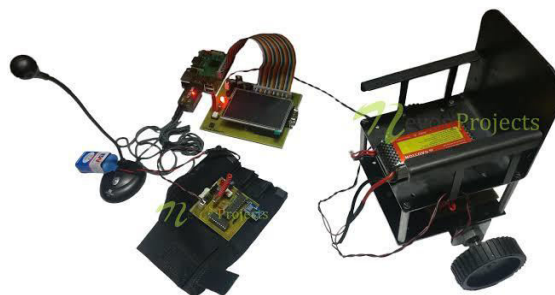
Fig 1. Multicontroller based wheelchair

Physical disability is increasing due to aging, accidents, and various diseases like paralysis. For this reason, the use of wheelchair is increasing. Some of the people who use the wheelchair cannot operate the wheelchair with their hands. So, they need the help of others to move the wheelchair from one place to the other. The android controlled wheelchair can overcome these problems mostly by the idea of implementing the wheelchair using android application, now a day's android mobile phones are commonly used. The wheelchair will be operated with the voice commands and gesture as inputs, which gives the directions as user directs. This wheelchair has gained more independent existence because the Arduino helps to covert the voice commands into outputs and the wheelchair can move freely. Along with this an ultrasonic sensor is used to detect the obstacles. By the proposed approach, the wheelchair will be working on the inputs such as voice, gesture and touch via an android phone that moves the wheelchair according to the commands provided. It. helps the physically disabled and aged people to move the wheelchair independently without any external support.