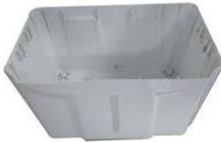
Figure 2: Water Tank

It is used to collect the water coming out from the heat exchanger. It has certain amount of capacity to store water that is used for liquid-liquid indirect type of heat exchanger.