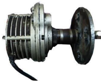
Fig 4. BLDC motor

A brushless DC motor (BLDC motor) is an electronically commuted DC motor which does not have brushes. BLDC motor is shown in Fig 4.