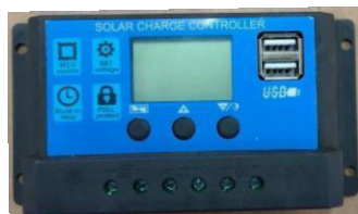
Fig 7. solar charge controller

An MPPT, or maximum power point tracker is an electronic DC to DC converter that optimizes the match between the solar array (PV panels), and the battery bank or utility grid. Fig 7. MPPT Solar Charge Controller. To put it simply, they convert a higher voltage DC output from solar panels (and a few wind generators) down to the lower voltage needed to charge batteries. The charge controller looks at the output of the panels and compares it to the battery voltage. It then figures out what is the best power that the panel can put out to charge the battery. It takes this and converts it to best voltage to get maximum AMPS into the battery. (Remember, it is Amps into the battery that counts). Most modern MPPT's are around 93-97% efficient in the conversion. You typically get a 20 to 45% power gain in winter and 10-15% in summer. Actual gain can vary widely depending on weather, temperature, battery state of charge, and other factors.