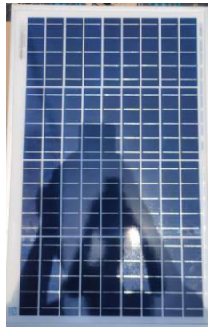
Fig 6. solar PV module

silicon, manufacturers melt many fragments of silicon together to form the wafers for the panel. Polycrystalline solar panels are also referred to as “multi-crystalline” or many-crystal silicon. Because there are many crystals in each cell, there is less freedom for the electrons to move. As a result, polycrystalline solar panels have lower efficiency ratings than mono crystalline panels, but their advantage is a lower price point. Solar PV module is shown in figure 6. Polycrystalline solar panels tend to have slightly lower heat tolerance than mono crystalline solar panels.