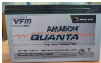
Fig 5. Lead acid battery

The batteries are the essential part of an electric vehicle. In our vehicle we use four lead acid batteries in series to get working voltage of 48V. We have used this to reduce the cost, Li-ion batteries can also be used to reduce the weight and it also has 3 times the life. A lead acid battery is shown in fig 5.