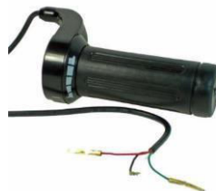
Fig 2. Accelerator

Accelerator is used to trigger the motor controllers. Here we use a cable to attach accelerator pedal to accelerator circuit mechanically. Accelerator consists of a Hall Effect sensor and a magnet. An accelerator is shown in fig 2.