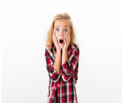
ARE YOU ALRIGHT