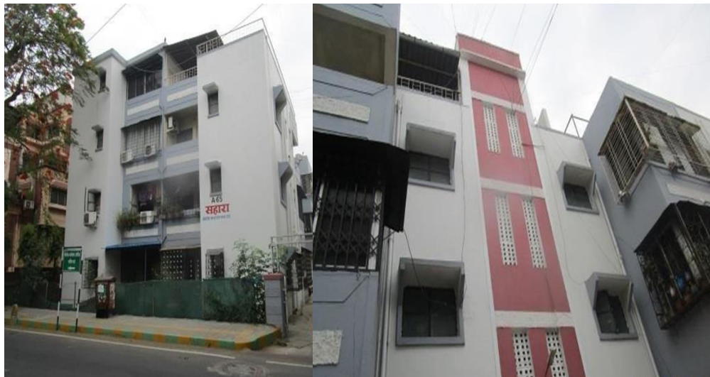
Fig 1: Site Details