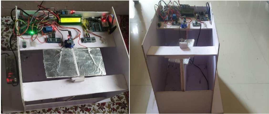
Fig 2: Results of Smart Dustbin