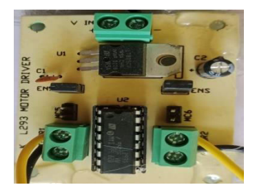
Fig.d Motor Driver Module – L293