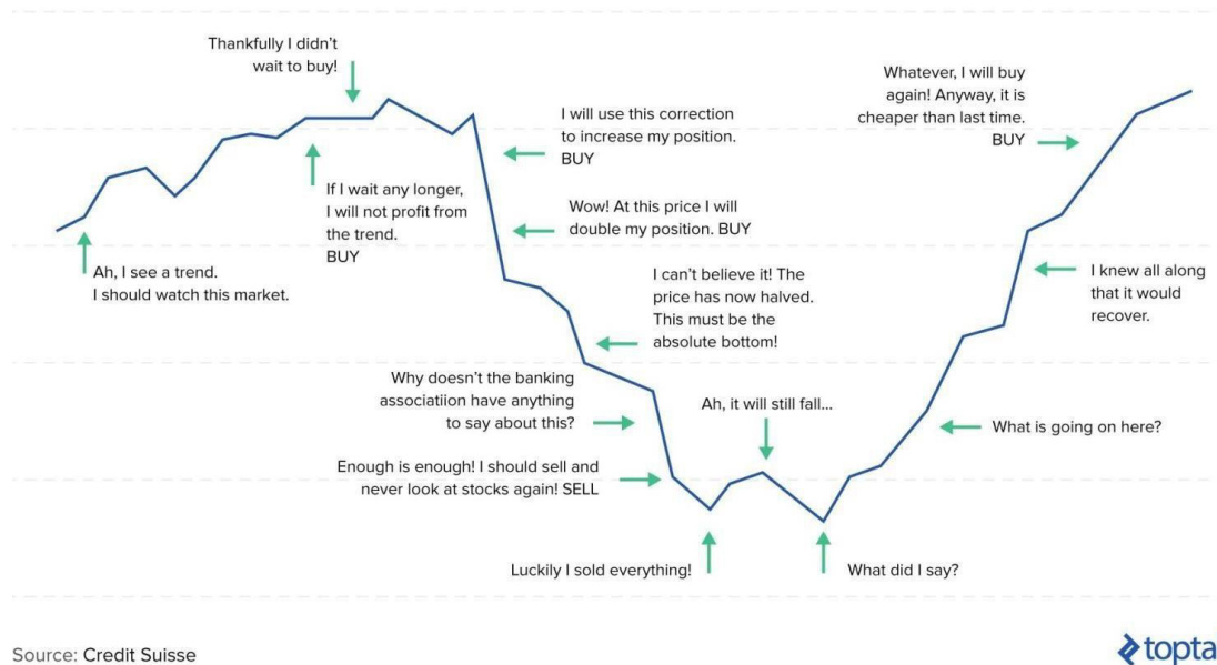
Figure 2: Investment Process - Roller Coaster of Emotions

People have to constantly make varied decisions throughout their lifetime. One area of cognitive psychology that has drawn attention is how people make decisions. Theories have been developed to explain how individuals make decisions and the types of variables that will continue to affect decision-making in the future.